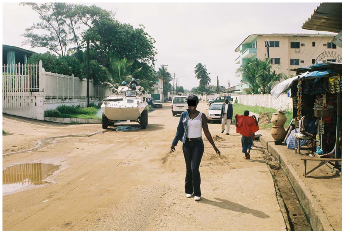
Girl commander after war, Monrovia 2004